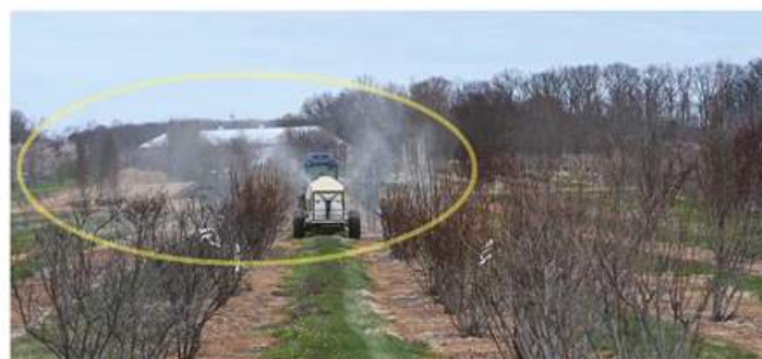
Figure 2. Airblast sprayer. Large drift cloud to the left and incomplete coverage to the right.