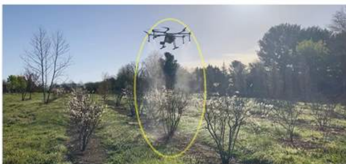
Figure 3. Drone sprayer. Small/negligible drift cloud and complete coverage of the target plant.